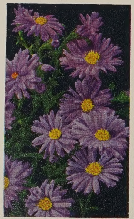
ASTER, Blue Gown

• Plant hardy perennials if you want bloom year after year with little care.